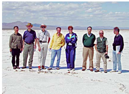
GRI group at Bristol Dry Lake, noted as a major source of table salt. Although the lake bed is covered with a layer of salt, most of the salt is a few feet below the surface.

One field trip visited Split Mountain in Anza-Borrego State Park, located just west of the Salton Sea in southernmost California. This area forms the margin between the Pacific Plate and the North American Plate. Neogene movement between the two plates has caused faulting and high rates of sedimentation, sometimes producing spectacular sedimentary exposures.