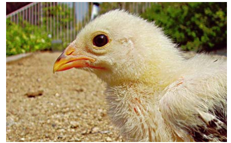
Chickens lack teeth, but have a gene for making teeth.

Comment. Some Cretaceous birds had teeth, but no Cenozoic fossil birds with teeth are known. Cretaceous fossils were probably deposited during the Flood, so only toothless birds have existed since the Flood. Survival of an